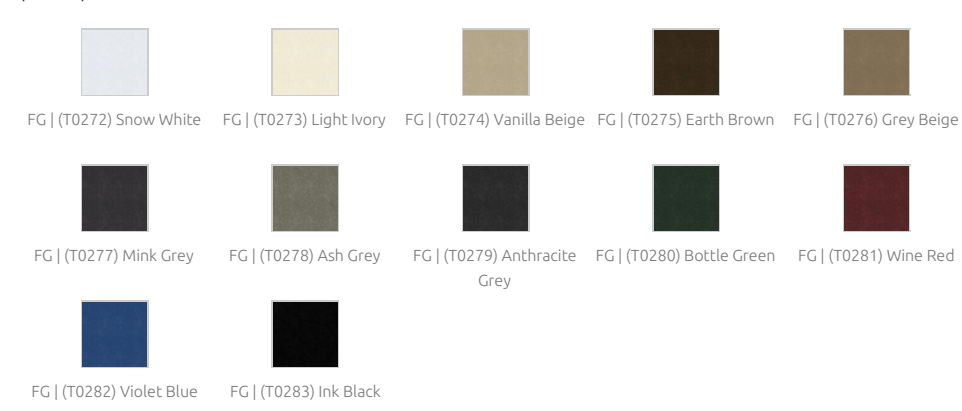
(FG - SF) Suede Fabric Finishes - NEW